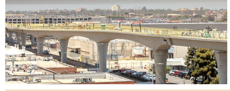
View of the guideway under construction. The guideway elevation varies to provide clearance over streets and buildings while maintaining the Federal Aviation Adminstration's overhead clearance requirements.

tensioning for the conventional box girders consists of draped tendons in the webs; there are typically three tendons in each web, with nineteen 0.6-in.-diameter strands per tendon. For the concrete segmental spans constructed using form travelers, tendons are located in the top and bottom slabs. The hybrid approach of concrete segments cast-in-place using form travelers and cast-in-place on falsework provides an unusual posttensioning layout in which three pairs of cantilever tendons in the deck transition over the piers to provide draped posttensioning in the back spans.