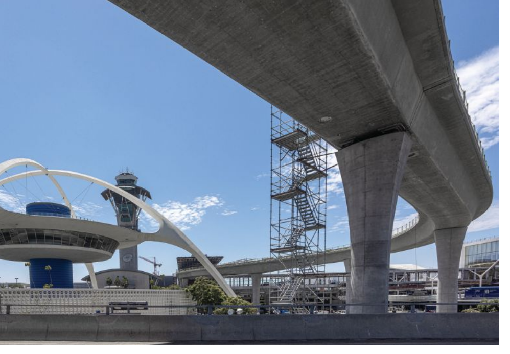
The guideway's sweeping alignment offers travelers remarkable views of the iconic theme building.

nearly 70,000 yd<sup>3</sup> of concrete were placed. Installation of appurtenances (such as the steel guide beam that will direct the vehicles on the guideway), switches, and other equipment continues on top of the guideway as of this writing. Operational testing of the vehicles on the system is expected to be initiated in phases, starting in 2023 with the track that connects the maintenance and storage facility and the ConRAC.