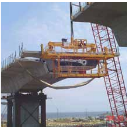
Segment erection was performed using the balanced cantilever construction method.

A post-tensioning system designed for extended service life structures was provided.