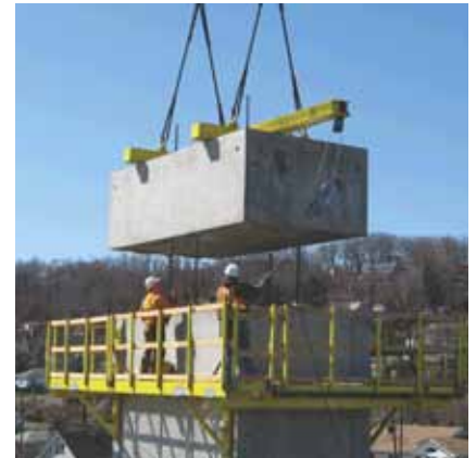
Precast pier segment erection proceeded quickly. Post-tensioning bars used to apply compression as the piers were erected are shown being inserted into the new segment. The bars were stressed after each segment was placed and then coupled to engage the subsequent segment.

The tendon anchorages could accommodate four, twelve, or nineteen 0.6-in.-diameter strands. The actual number of strands used in each anchor varied based on application, span length, and structural demands. Generally