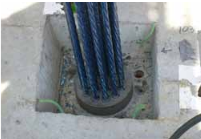
Shown here is a 19 strand wedge plate after lock-off at the anchorage of a vertical pier tendon. Special wedges were provided that gripped the strand through the epoxy coating. Use of these wedges promoted field labor savings and maintained an uncompromised epoxy coating rather than stripping epoxy from the strand ends for wedge bite.