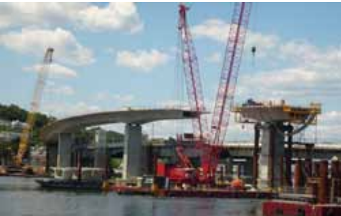
Balanced cantilever construction of the eastbound bridge as viewed from the eastern shore.