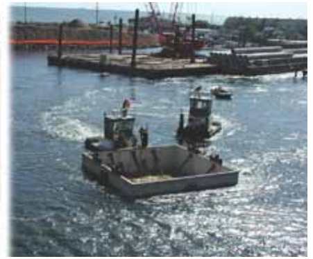
A precast concrete coffer dam shown as it is lowered into the water for the short trip to a bridge pier. The granite form-liner finish was required to match existing work at the site.

The new bridge will provide 65-ft minimum vertical clearances.