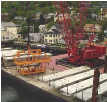
Segments were shipped from the precasting plant to the bridge site by barge, and were erected using a ringer crane and specially designed spreader beam. The stressing and installation platform was attached to the segments prior to lifting.