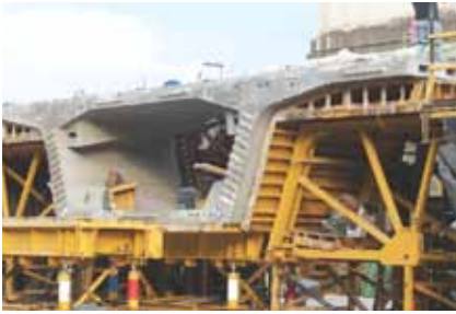
A match-cast superstructure segment shown at the Unistress precasting plant.